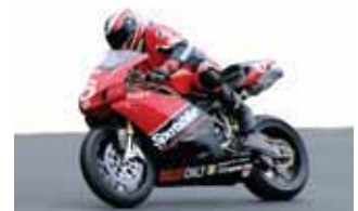
AS USED BY THE SPORTSBIKE RACING TEAM

SEND TO: DUCATIONLY P.O.Box 1022 Double Bay NSW 2028 AUSTRALIA For assistance Telephone: +61 (02) 9344 6523 or e-mail: info@ducationly.com.au